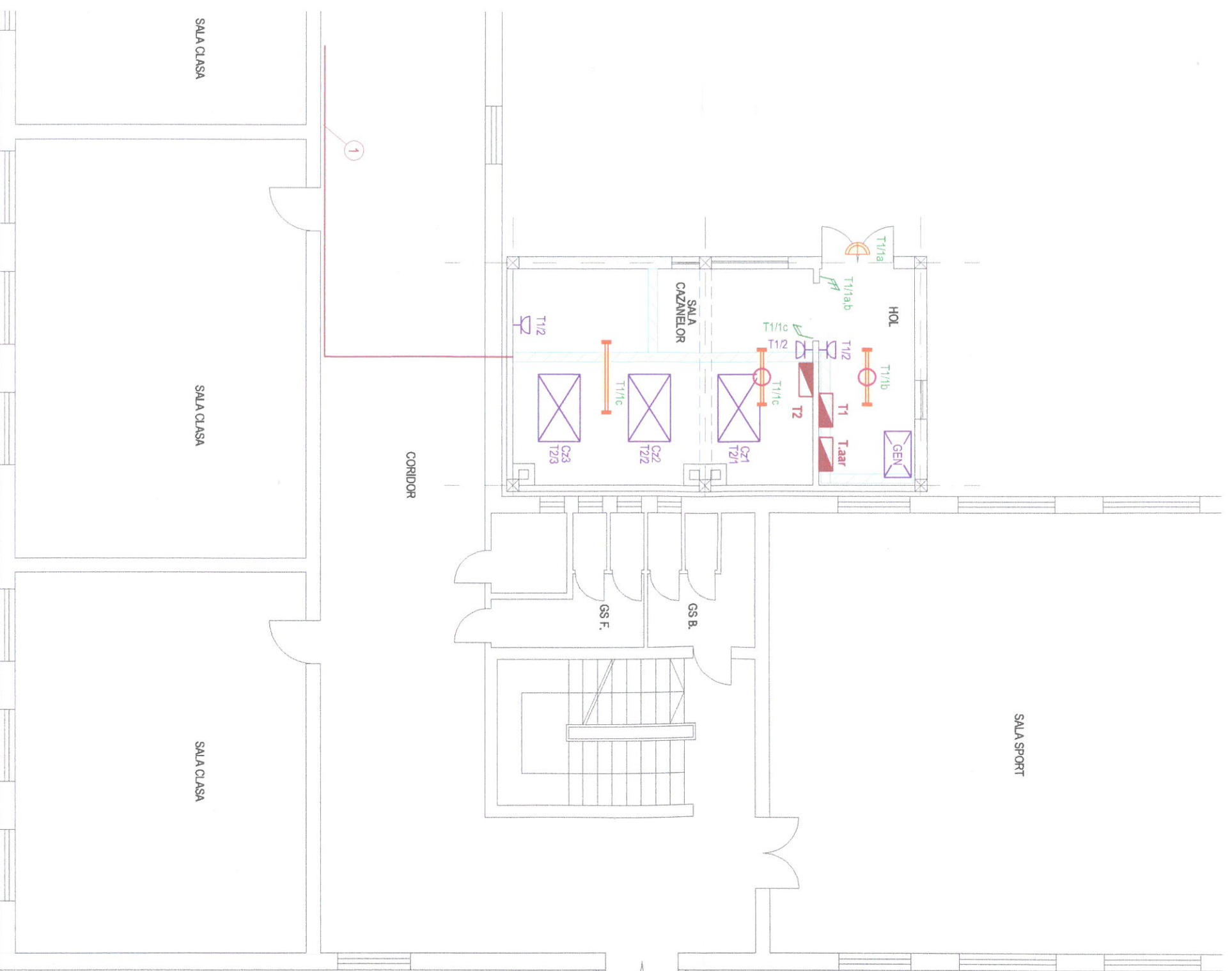
TABLOU ELECTRIC T1